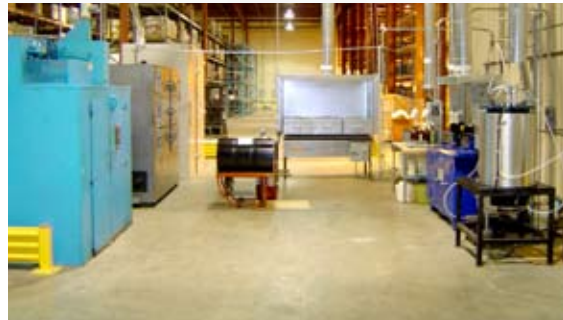
You're looking at the only Vulkollan caster wheel manufacturing facility in North America.