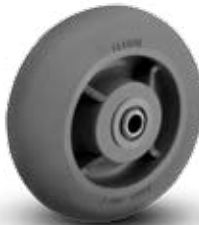
Heavy Duty XR