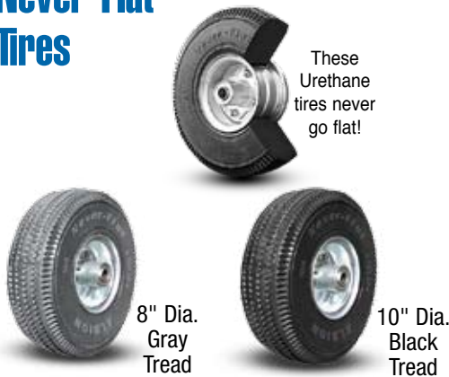
8" Dia. Gray Tread