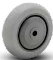
Light Duty XR