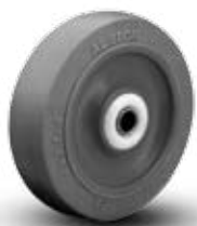
Light Duty XS