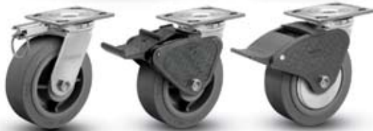
Swivel Lock ("L")