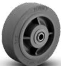
Heavy Duty XS